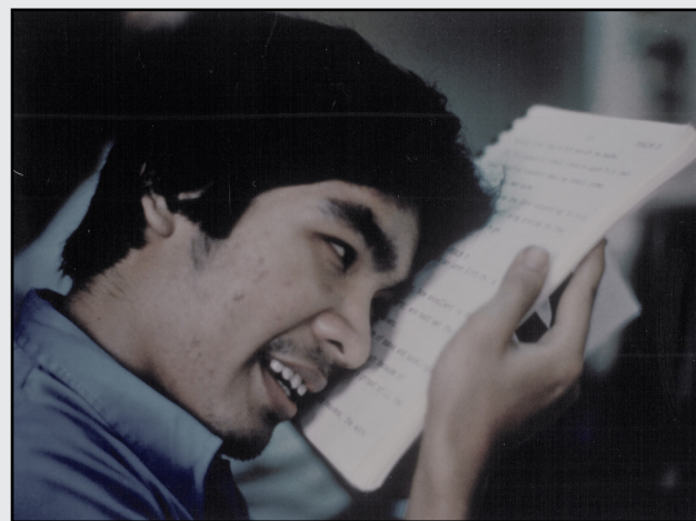
This young man is happy to read one of the first Large Print books of Psalms

maintained and the workload continued to increase substantially. More people were being reached indeed! --Roy Fisher